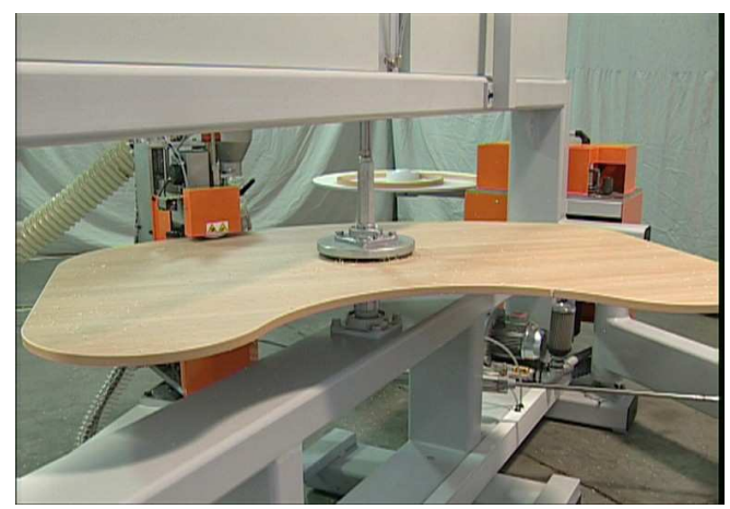
Second phase: Trimming of the edge

Maggi Engineering Woodworking machineryVia delle Regioni, 299 | 50052 CERTALDO (FI) Itay | Tel.: +39 0571 635488 | Fax: +39 0571 664275<br/>E-mail: sales@maggi-engineering.com | Web site: www.maggi-engineering.com